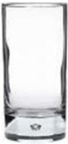
(12oz High Ball)

A replacement charge will be made for any packing cartons or sections not returned, or returned in a damp or dirty condition.